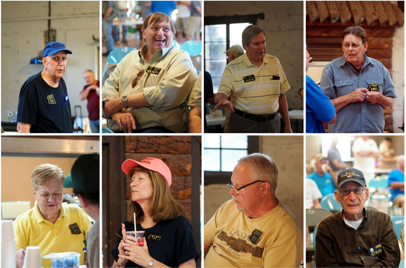
Yavapai Amateur Radio Club — General Meeting, June 6, 2024 Top Row, Left to Right: KD7RK, WB7RFY, WA6SCW, KW6J; Bottom Row, Left to Right: KJ6KMK, W1QT, K7PVY, N7PJM