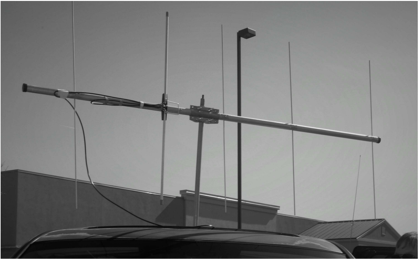
Fox Hunt Antenna, February 4, 2023