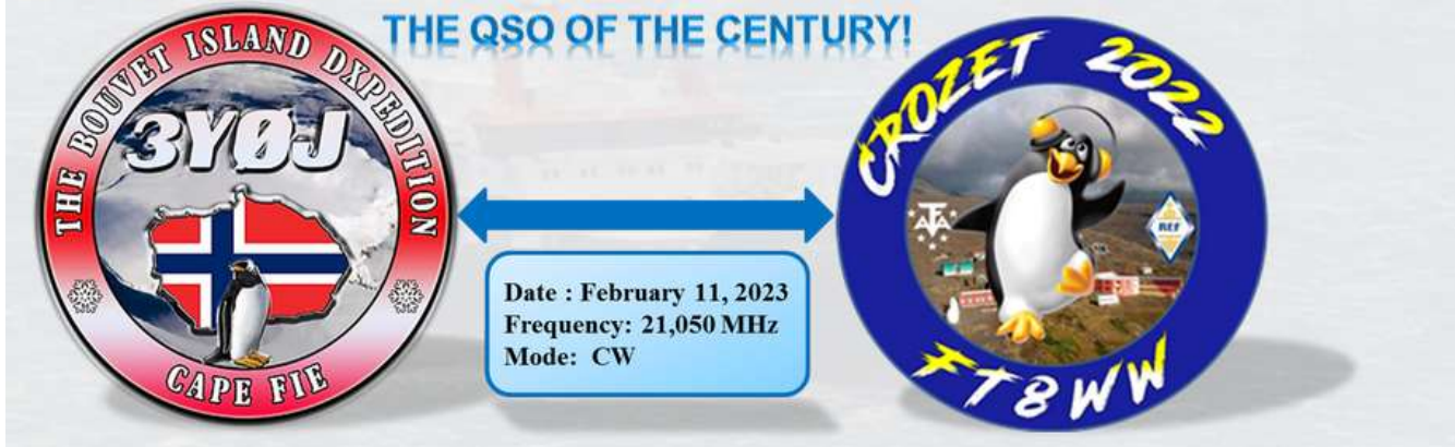
The Latest Obsession of DXers

This morning a QSO took place between Bouvet and Crozet in CW on 21.050 MHz. This contact between the number two and the number three of the most wanted DXCCs is an event that will remain unmatched for a long time!!!