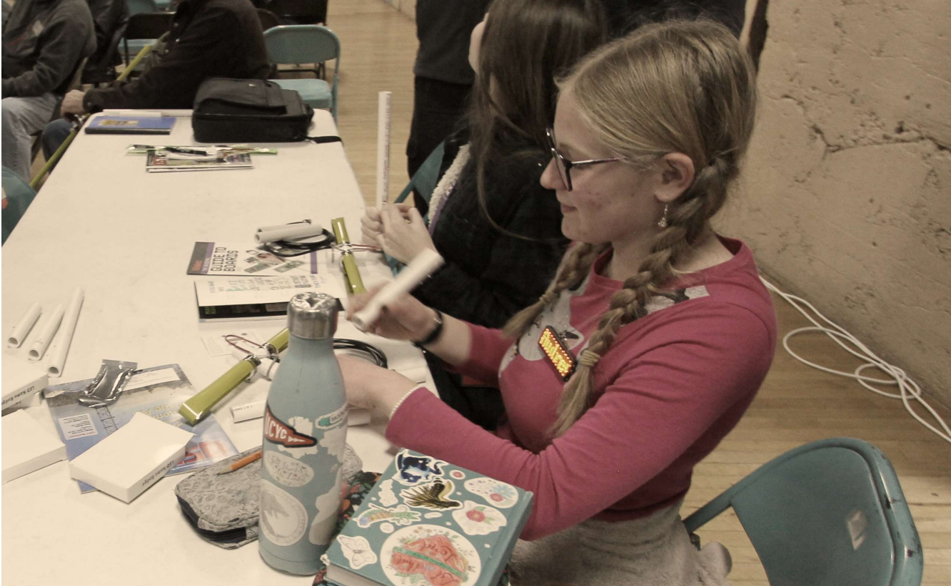
Making a 2M Tape Measure Yagi Antenna — YARC General Meeting, February 2, 2023