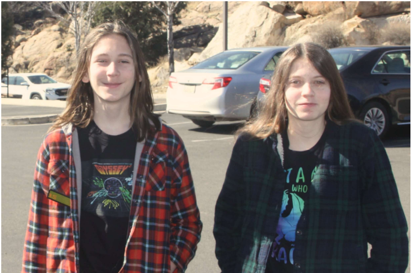
Young Fox Hunt Participants, February 4, 2023