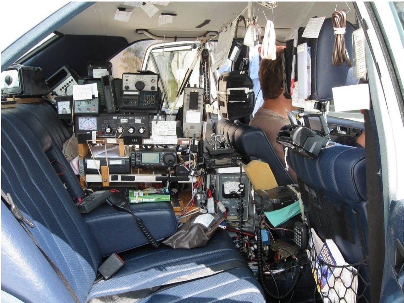
Setting Up for Field Day, June 27, 2020