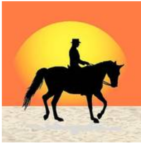
October 3, 2017 Man/Horse Race Public Service Event