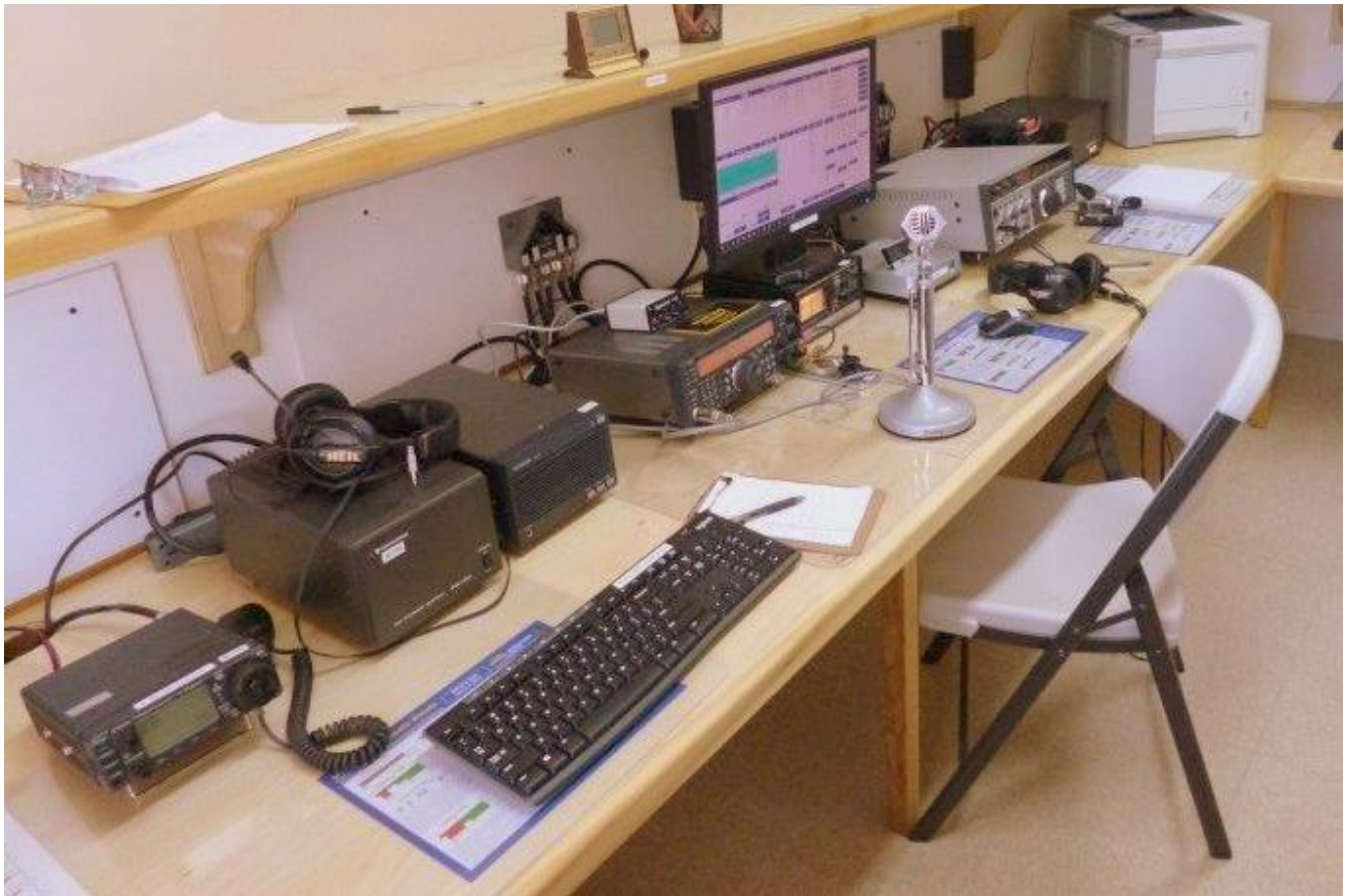
W7YRC Club Station at the Jeep Posse Building in Prescott, Arizona