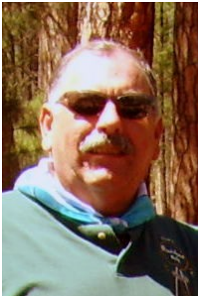
R: Art KA5DWI