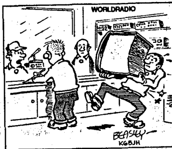
NO, NO, I WANT THE UNABRIDGED EDITION OF "COMPLETELY UNDERSTANDING ANTENNAS AND FEED LINES!"

Thursday Morning Breakfast-Micheal's Restaurant in the Safeway Shopping Center, Prescott Valley. 8:00am. All are invited.