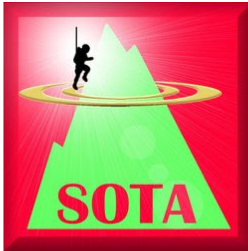
Summits On The Air Mount Humphreys, Coconino County, Arizona October 19, 2016