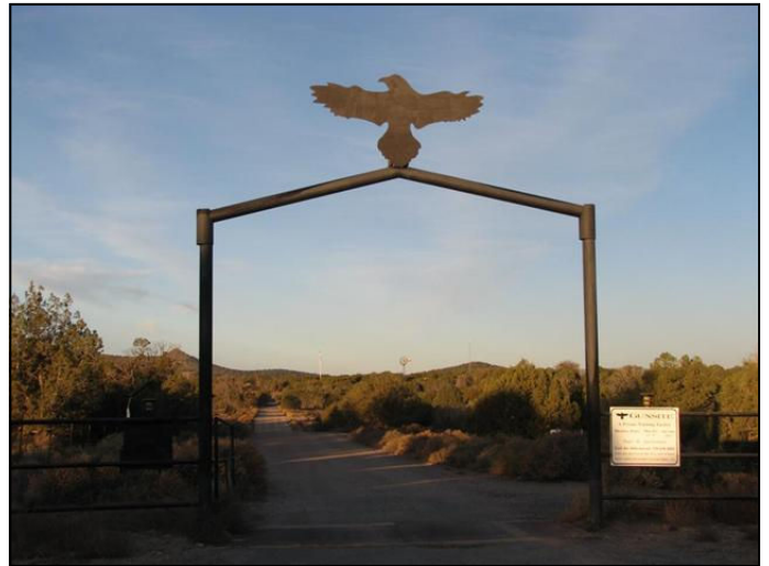
Gunsite Academy Gate