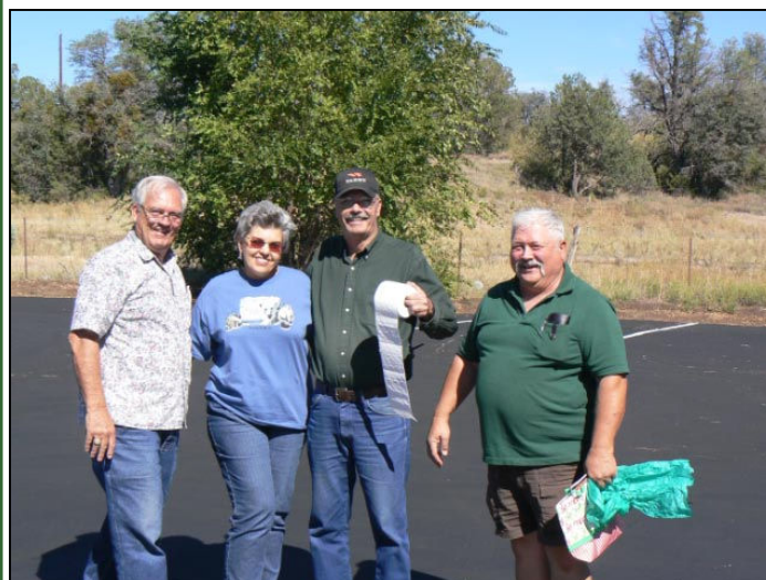
A Special Award for this hunt