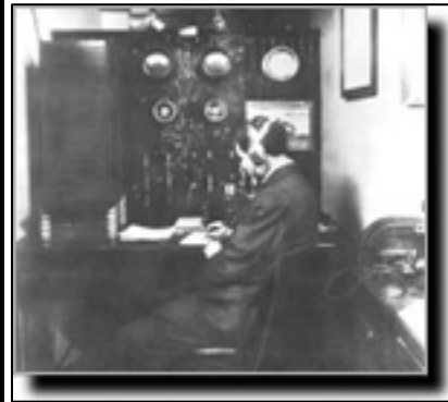
David Sarnoff on duty at the NBC Wanamaker station.

Sarnoff, a broadcast pioneer and visionary who would later lead RCA and establish the National Broadcasting Company, was a Marconi radio operator in 1912. He was on duty at the