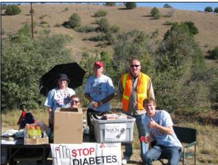
Water Station # 3 Volunteers

You can see some of the pictures I took at: http://tinyurl.com/2cgm7yd ■