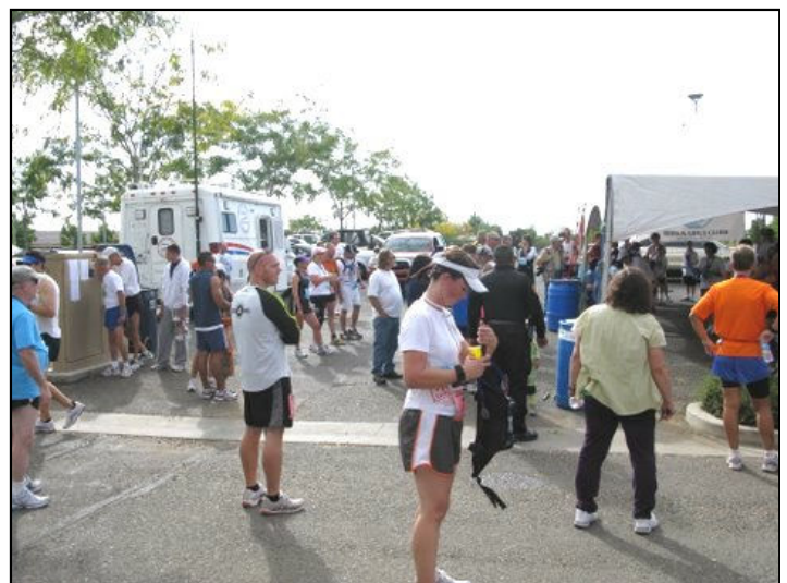
Awards being handed out at the Tour DE Pee Vee Event

On Saturday, September 19 th the weather was once again ideal when communications were provided for the 7 th annual running of the Tour De Pee Vee ½ Marathon, 10K, 5K and Two mile run/walk in Prescott Valley.