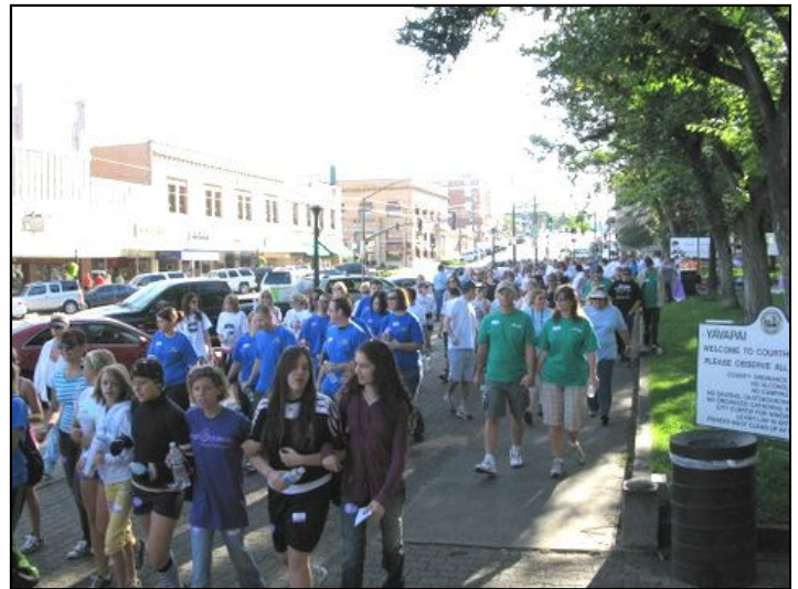
165+ Walkers starting in the MOD March for Babies

There were approximately 165+ walkers in the event and $30,000.00 was raised for the March of Dimes. The MOD