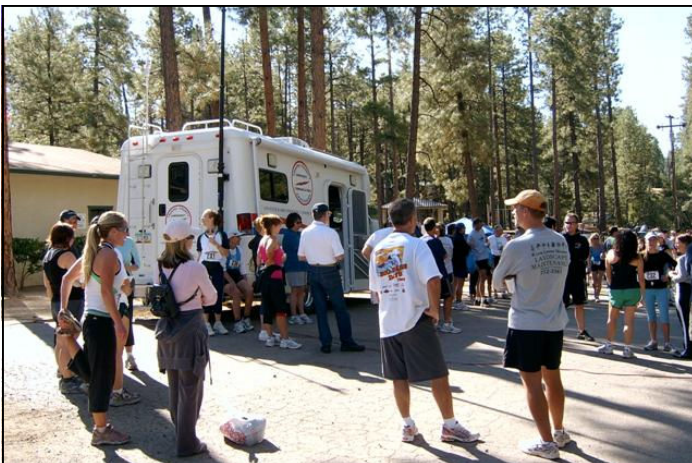
Runners awaiting results for the Groom Creek Classic

Saturday, September 26 th found some of our dedicated YARC special event communicators out in the forest around Groom Creek for the 5 th Annual Groom Creek Classic. Temperatures were a little on the cool side approaching 7:30 a.m. when the first race started, but began warming to an