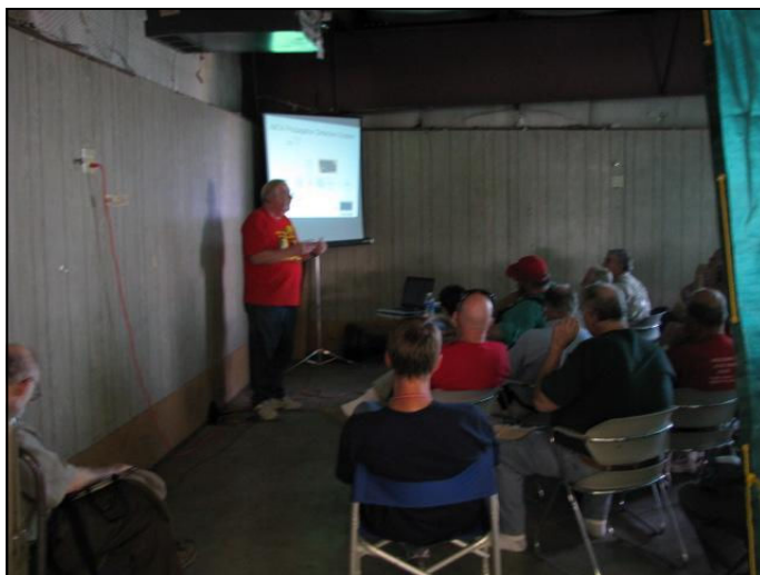
One of the seminars held in the Exhibit Hall