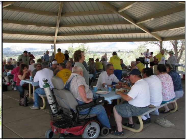
Club members and family enjoying food and friends.