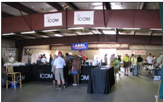
ARRL, ICOM, ARCA, RF Stuff & other booths located in the Exhibit Hall