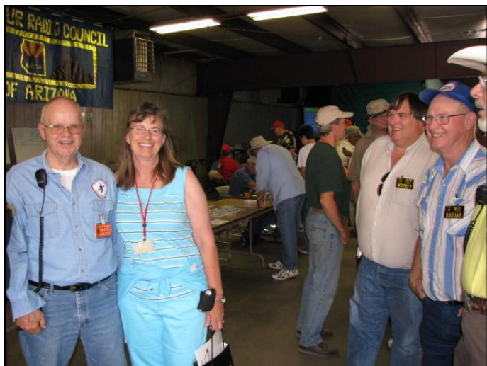
Some familiar faces.