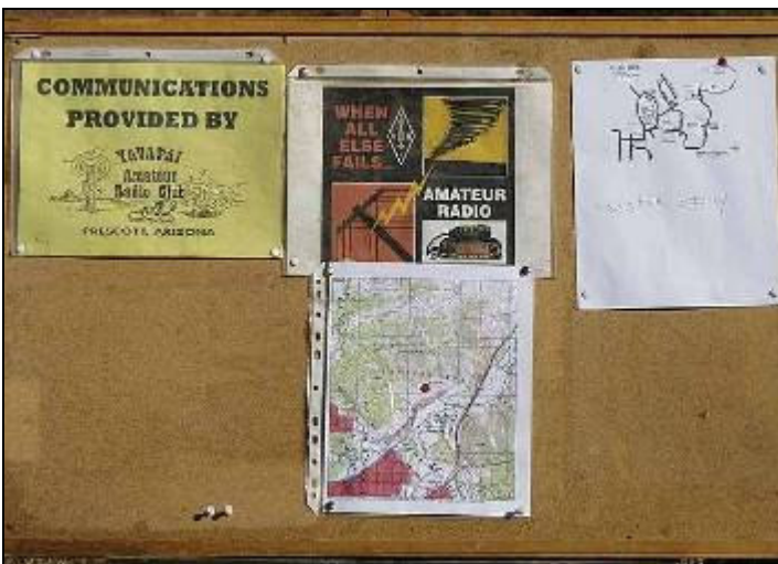
Fred's display at Break Station 4.