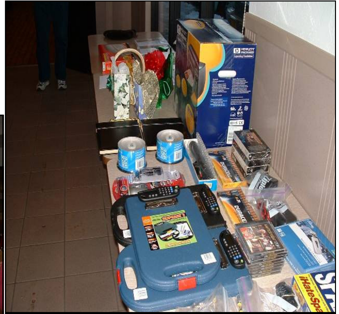
Lots of Prizes