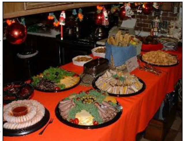
A Sample of the Delicacies Offered to Guests

The "Petite Elite Miniature Horse Team" made a brief appearance as entry #47.