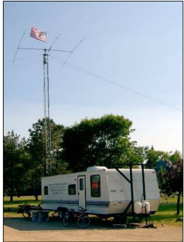
Three Rivers Amateur Radio Club Command Center

haven't had communications with them since to see how they did, but their operator base was limited to about seven people. Being on a limited time schedule, we did not get a chance to operate from their location to help them out, but it was interesting to see their setup and chat with the operators there.